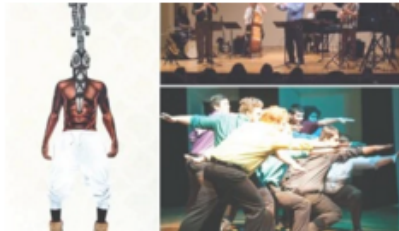
CofC Arts Abound for Fall 2016 In "Campus Life"