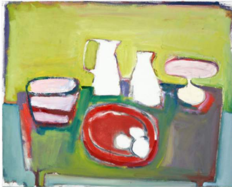
Shift Gallery Seattle: Eric Day Chamberlain's Red Plate Yellow Background, 2016

Art will soothe. Art also prides itself in its ability to calm. Consider Eric Day Chamberlain's Red Plate Yellow Background, 2016. Chamberlain is represented by Shift Gallery Seattle .