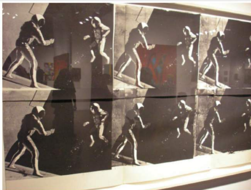
David Zwirner Gallery: Andy Warhol's Astronauts, 1963

Art will soothe. Art also prides itself in its ability to calm. Consider Eric Day Chamberlain's Red Plate Yellow Background, 2016. Chamberlain is represented by Shift Gallery Seattle .