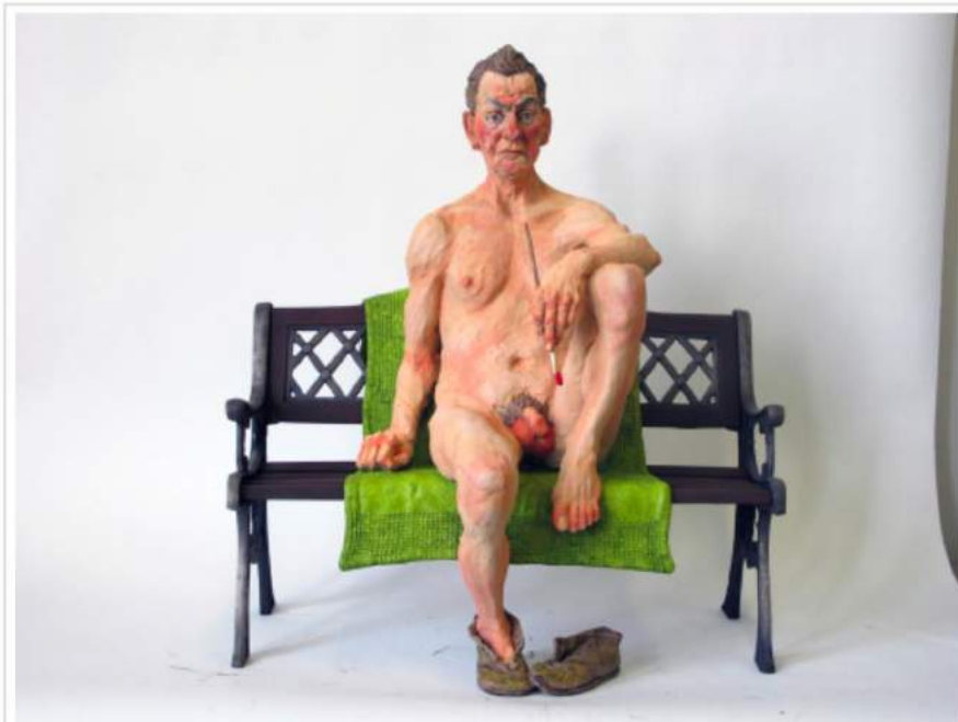
Winchester Galleries: Joe Fafard's Lucien Freud , 2014