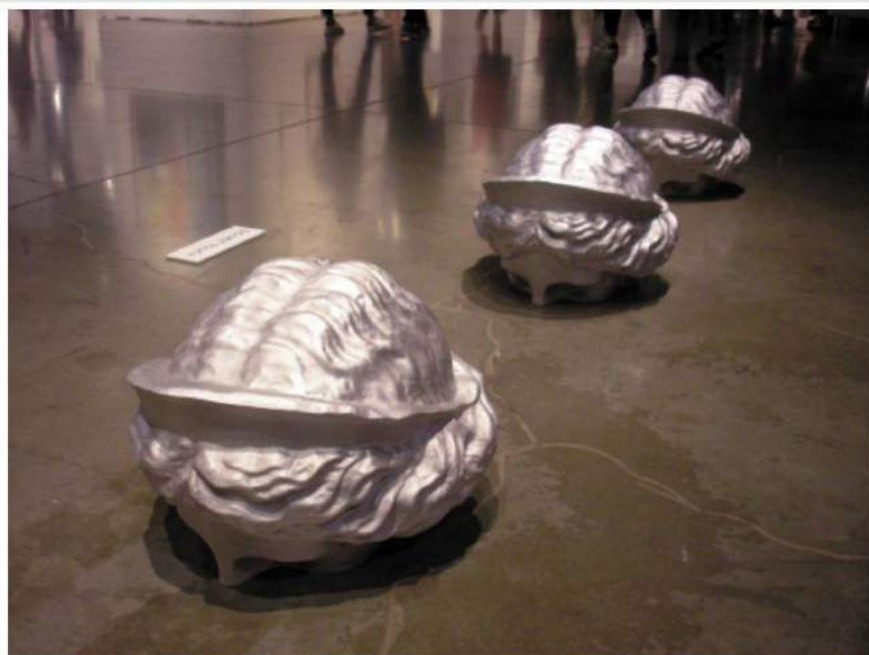
Sean Townley's 7 Diadems, 2016.

If you are in the Seattle area, you can still catch the final day of Seattle Art Fair this Sunday. And, if you should not be able to make it, be sure to visit the Seattle Art Fair website for details on all the participating galleries. The following is my recap of my visit on Saturday. There are a number of ways to take it the show with countless observations to make and insights to gain. Here are a few of mine.