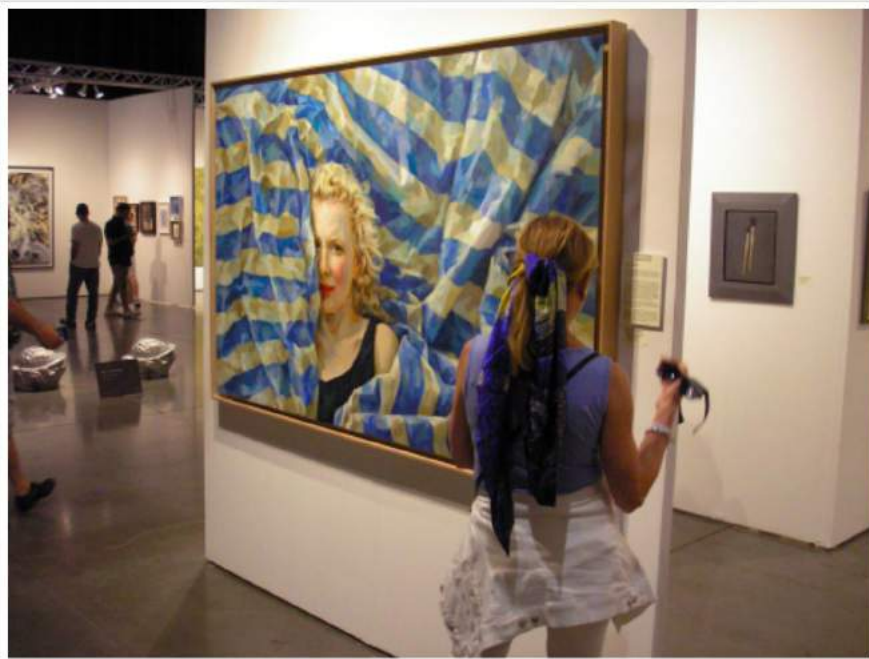
Forum Gallery: Xenia Hausner's Gone Girl , 2014

Lose yourself. Art can certainly be as fun as it is intense. Consider Xenia Hausner's Gone Girl , represented by Forum Gallery .