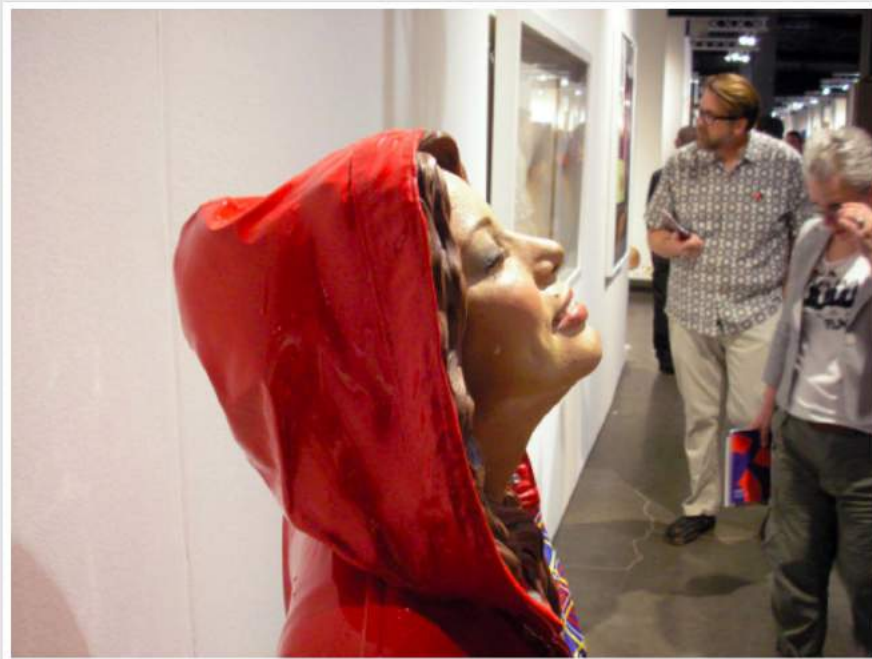
C24 Gallery: Carole Feuerman's City Slicker

The art is alive. Engage with it as it is already engaging with you or so it certainly seems. Carole Feuerman's City Slicker was a crowd favorite. Represented by C24 Gallery .