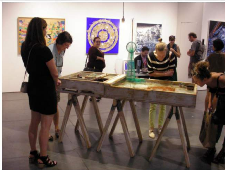
From Joshua Liner Gallery: Riusuke Fukahori's The Ark (Goldfish Salvation), 2015

If you are in the Seattle area, you can still catch the final day of Seattle Art Fair this Sunday. And, if you should not be able to make it, be sure to visit the Seattle Art Fair website for details on all the participating galleries. The following is my recap of my visit on Saturday. There are a number of ways to take it the show with countless observations to make and insights to gain. Here are a few of mine.