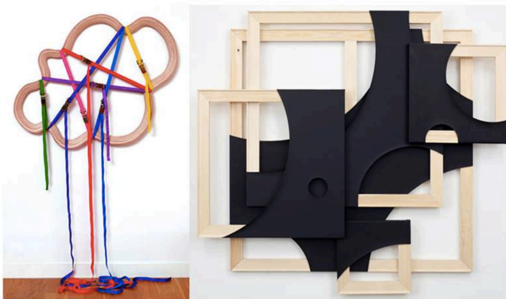
Left: OX – Strapped Cloud, 2015. Wood and straps, 39 x 53 in, 100x135cm / Right: Jan Kaláb – Black Planes. Acrylic on cut-through canvases, 44 x 48 in, 112 x 121 cm

With this group exhibition, Rero wanted to put his curatorial skills to use, in order to evoke a unique experience of art for his viewers. To achieve such compelling sensations, he brought together five artists from five different countries around the world, whose visions and practices create a marvellous variety of artworks and even topics. Calling it TRANSBORDER , Rero presents creation as a unifying element of humanity, a pretext for meetings and travel in which objects, materials and works come together to form a great visual impact. And so, these six artists go on to explore what's beyond the boundaries, through the transitory elements of form, color, shape and context, trying to get liberated from any kind of constraints, impositions, or even rules. It is six different minds, guided by the same urge to cross the line – to go TRANSBORDER .