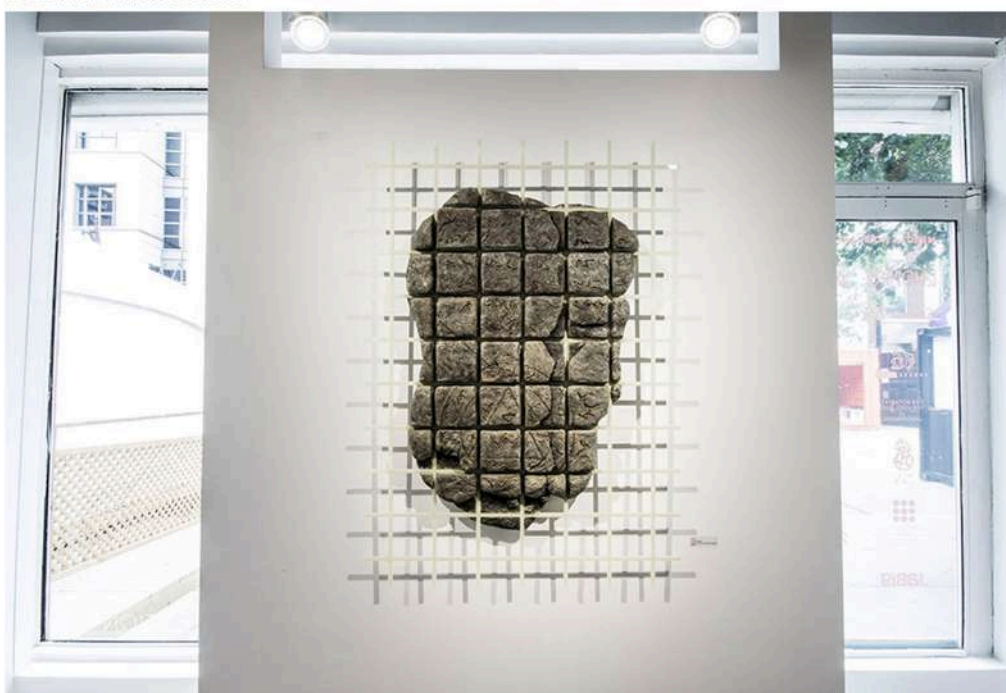
Cyrle - Nothing Exists.

How do five prominent contemporary artists go beyond the borders within art? How do their different cultural and artistic approaches influence this process? What happens when a variety of techniques come together to create a world on the other side of any physical or ideological frontier? The answers to these questions will soon be revealed in an exhibition curated by French artist Rero , and his little get-together will be hosted by Culver City's Fabien Castanier Gallery. Joining him on the TRANSBORDER journey there are five other prominent contemporary artists, whose work you most certainly know. Through their abstract and figurative creations, Cyrle , Jan Kaláb , Ox , Andrey Zignatto , Anibal Vallejo and of course Rero will create a dialogue and narrate art as a form of human adventure.